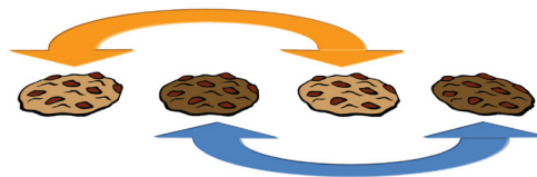
Figure 1. Instructions for Tetrad testing.